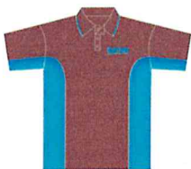
Rec-Year 4 Polo