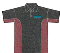
Year 5-7 Polo